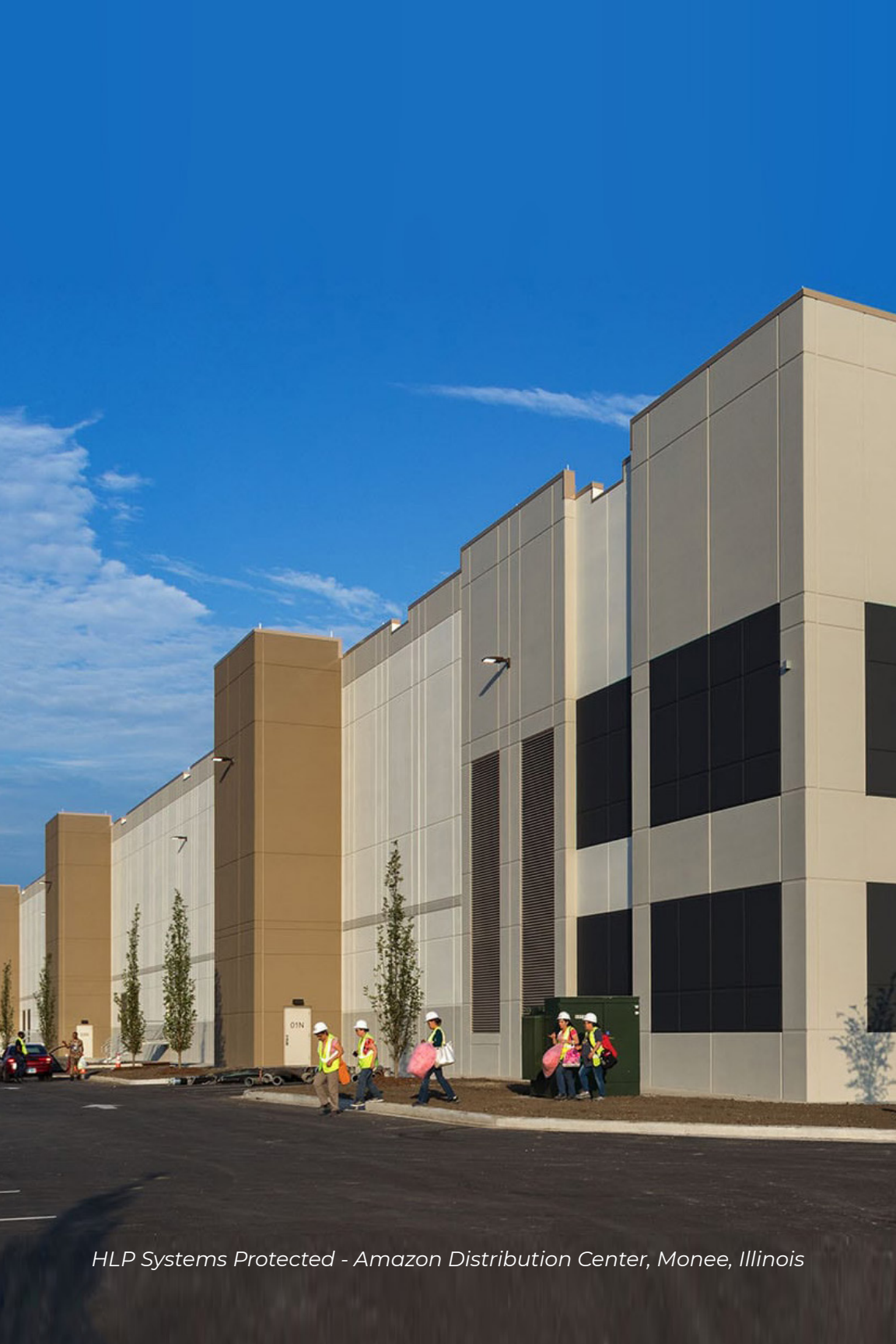
HLP Systems Protected - Amazon Distribution Center, Monee, Illinois